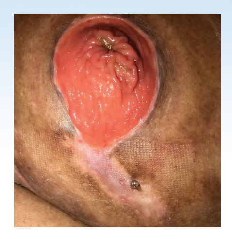
Figure 6 Complete closure May 2019