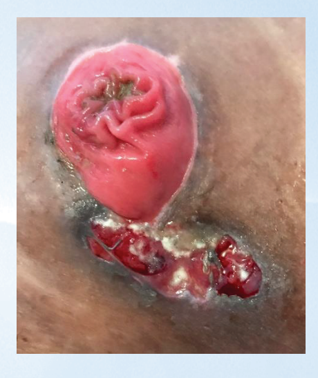
Figure 1. Initial Assessment June 2017

Upon initial examination, June 2017, it was determined that the decubitus developed as a result of pressure from the rim of the two-piece appliance. Due to patient's very soft abdomen, a good deal of pressing down was required to snap the pouch onto the rim of the skin barrier with each pouch change; thus, creating ulceration.