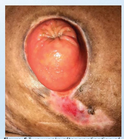
Figure 5 Two weeks after application of collagen particles – February 2019