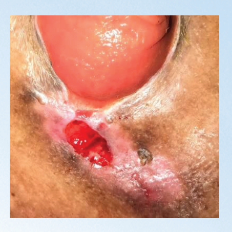
Figure 4-Thirteen months later -July 2018